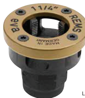
Left-hand pipe thread