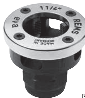
Right-hand pipe thread