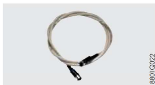
Intermodule connecting cable - length 1.5 m - Package AD 124

Needed to manage a cascade of boilers equipped with OT controller. The board should be installed directly in the boiler.