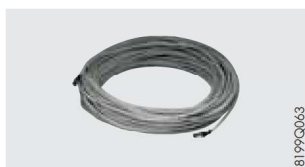
BUS connecting cable - long. 40 m - Package DB 119

This is used for the interconnection of two DIEMATIC VM iSystem wall-mounted control systems.