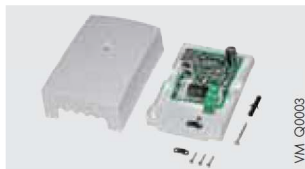
Wall-mounted box OpenTherm/Modbus Interface - Package AD 286

Needed to control a boiler cascade equipped with OT controller (1 board per boiler).