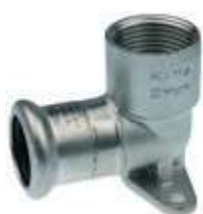
R2716 Wallplate 90° (press x female thread)