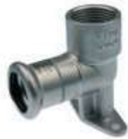
R2737 Wallplate 90° long (press x female thread)