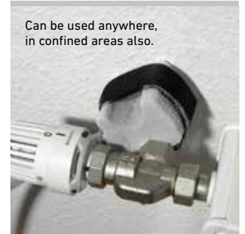
Can be used anywhere, in confined areas also.