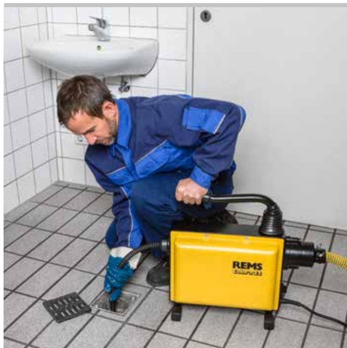
German Quality Product

Large variety of pipe and drain cleaning tools (page 286 – 287), also fit into pipe and drain cleaning machines of other makes.