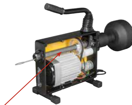
Straight through closed drive spindle protects motor and drive against dirt and water.