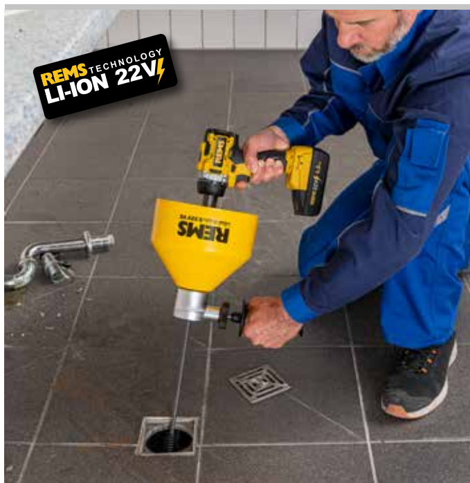
German Quality Product

Li-Ion 22V Technology. Highly resistant Li-Ion 21.6V battery with 1.5, 4.4, 5.0 or 9.0Ah capacity, for long service life. Light and powerful. Graduated charging status check by coloured LEDs. Operating temperature range – 10 to + 60 °C. No memory effect for maximum battery power. Rapid charger 100–240V, 90W. Rapid charger 100–240V, 290W, for shorter charging times, as accessory. 220–240V/21.6V, 15A output, voltage supply for mains operation instead of Li-Ion battery 21.6V, as accessory.