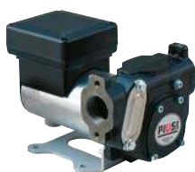
DC PUMP - PANTHER DC