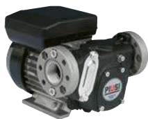
AC PUMP - PANTHER 56/72