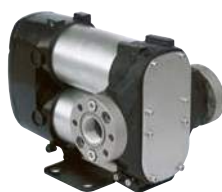
DC PUMP - BIPUMP