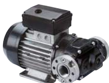
AC PUMP - E80/E120