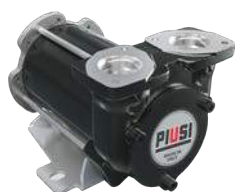
DC PUMP - BYPASS 3000