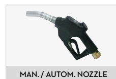
MAN. / AUTOM. NOZZLE