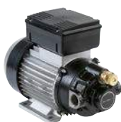
AC PUMP - VISCOMAT 70/90