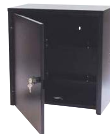
METALLIC BOX (optional)