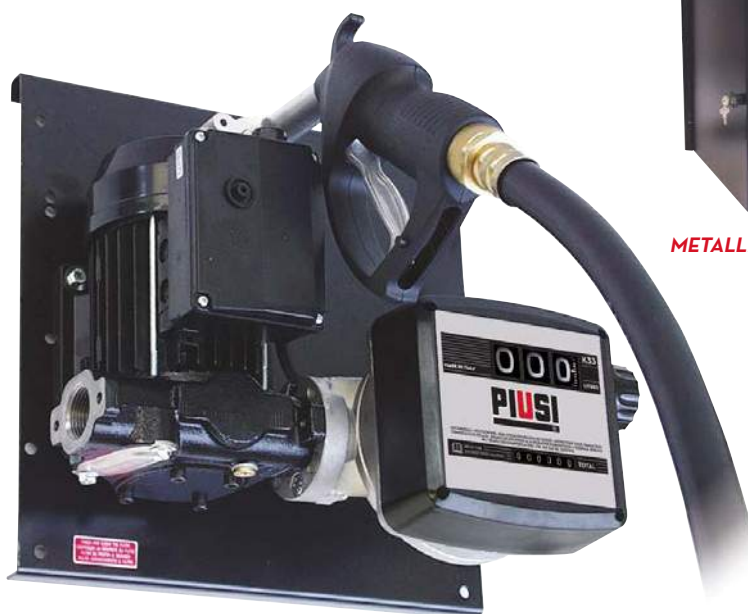
ST WITH METER