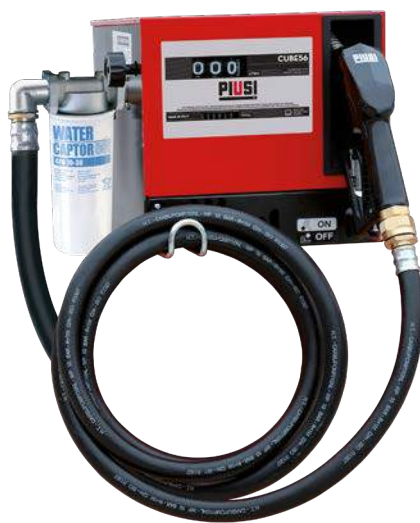
CUBE 56 WITH FILTER