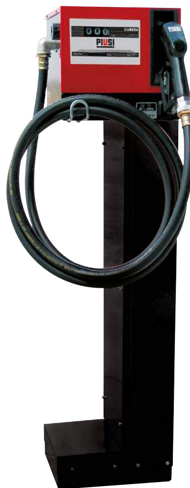
CUBE 56 WITH PEDESTAL (optional)