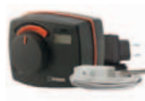
CRC111 230 VAC

Auxiliary switch kit ARA801 _____ Art. No. 1620 07 00 Flow pipe sensor CRA911, 5m cable _____ Art. No. 1705 31 00 GSM-module CRB915 _____ Art. No. 1705 59 00