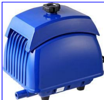
Linear air pump DB60